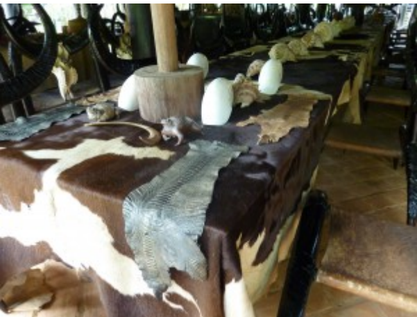
'Baandam' collection of hides and

In fact, Thawan Duchanee's estate is an interesting collection of bizarre, surreal structures including a zoo's worth of animal skeletons ☐