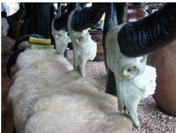
'Baandam' On skeletons*

Nevertheless, 'Baandam' a special kind of museum because the objects and artefacts of the Black House Museum are all related to death, mortality and impermanence. In other words, one may also say that they highlight the negative side of