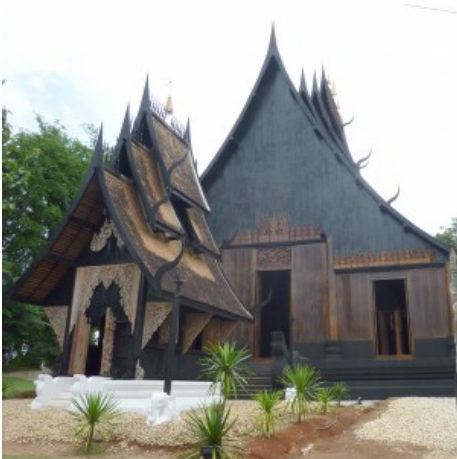
'Baandam' main building*