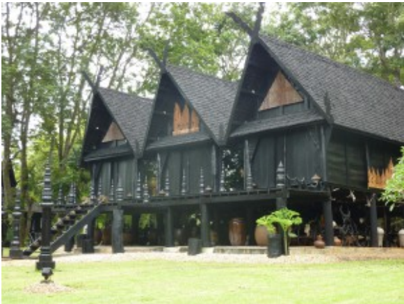
White Temple and Black House in Chiang Rai