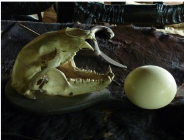
'Baandam' skull and egg*

Hence, there are many skulls from different animals as well as skins (e.g. snake skins), hides, eggs and carvings of more traditional demons. In addition, 'Baandam' also has interesting furniture and special collectors' pieces to offer.