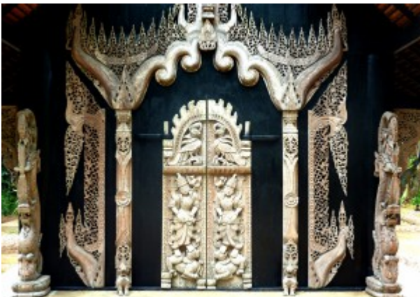
'Baandam' carved façade*

Hence, there are many skulls from different animals as well as skins (e.g. snake skins), hides, eggs and carvings of more traditional demons. In addition, 'Baandam' also has interesting furniture and special collectors' pieces to offer.