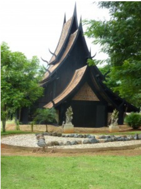
'Baandam' tiered roof house*

This tendency is also reflected in the Black houses of 'Baandam' in Chiang Rai. Thus, the Black Houses are designed in different styles and what is special about them is that their colour is predominantly black. Hence, there are also some white buildings but their only function is to bring out the Black Houses even more distinctly. Most of the Black Houses of the 'Baandam' Museum serve as a kind of 'showroom' for various artefacts, curiosities and oddities.