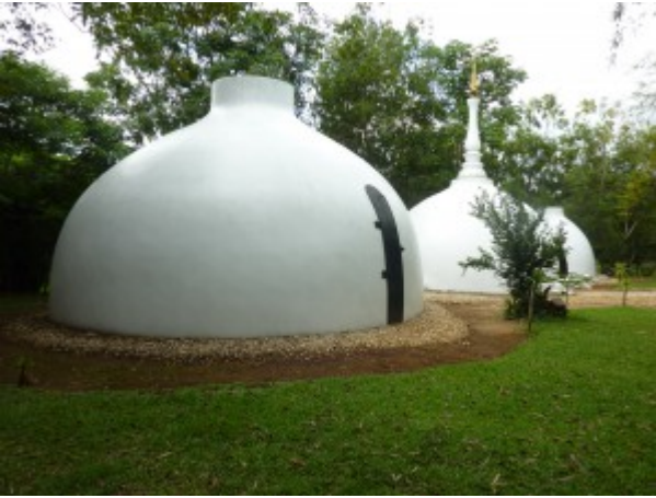
'Baandam' cylindrical white building*

In fact, Thawan Duchanee's estate is an interesting collection of bizarre, surreal structures including a zoo's worth of animal skeletons ☐