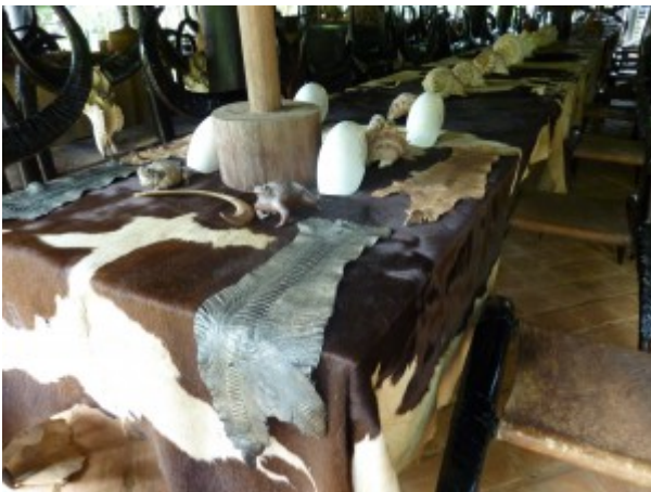
'Baandam' collection of hides and

In fact, Thawan Duchanee's estate is an interesting collection of bizarre, surreal structures including a zoo's worth of animal skeletons ☐