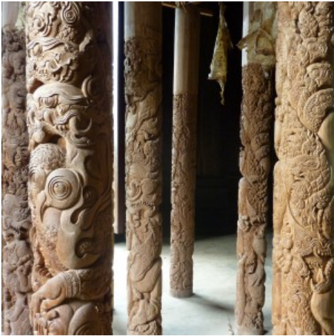
'Baandam carved pillars*