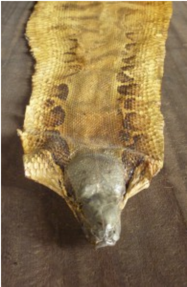
'Baandam' snake skin*