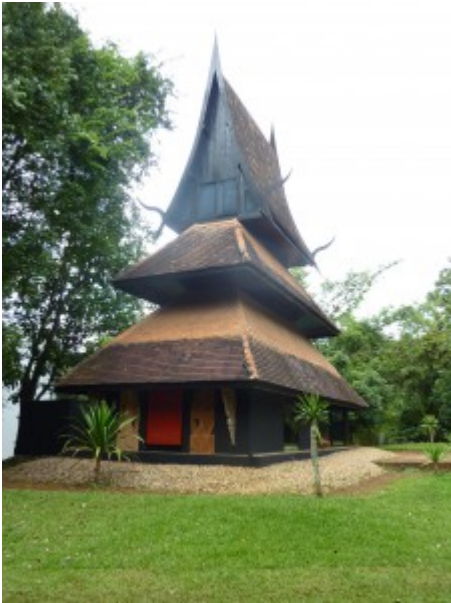
'Baandam' tiered building*